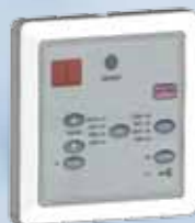
New ducted ceiling design Wall mounted controls

Aircommand brings you even more options for climate control with the new CORMORANT ducted style air distribution system. For the first time you can direct the air flow to where you need it most in your RV. Get an even comfort all year around with the new Aircommand CORMORANT ducted ceiling system.